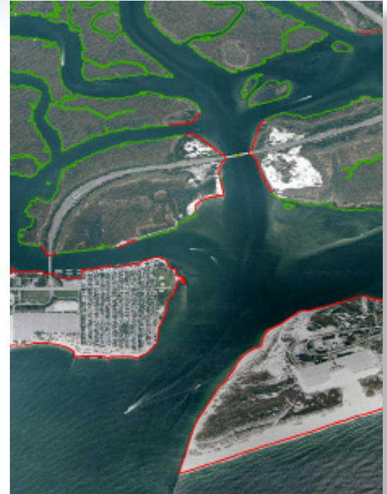
Image of Jones Inlet, Long Island, NY using Applanix Digital Sensor System. The green line represents marsh (apparent) shoreline, and red line represents mean-high water shoreline.

NGS delineates the shoreline through various photogrammetric sources, including tide-coordinated stereo aerial photographs, commercial satellite imagery, Light Detection and Ranging (LiDAR), and related remote sensing technologies. The data-gathering